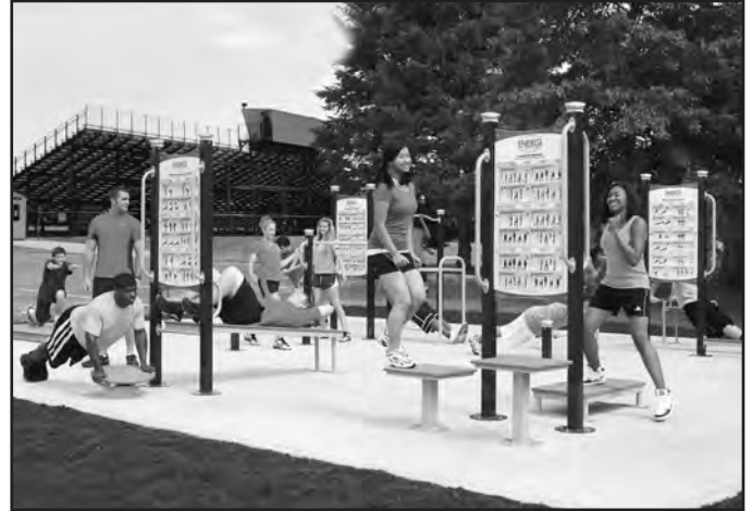
(Photograph used by permission)

PRPD's Applewood Park Outdoor Fitness System Project consists of the installation of an outdoor, total body fitness system. Five stations, featuring three skill levels and 120 exercises, will be clustered on a concrete pad. The cluster concept allows for circuit training and programming. As users of the system gain familiarity with the system and improve in performance, they can increase their skill level. The system is designed for ages 13 and up.